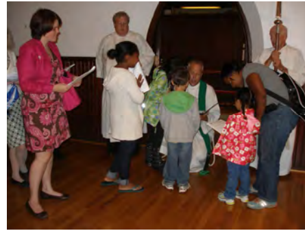
Children singing an opening verse on their first Sunday back.