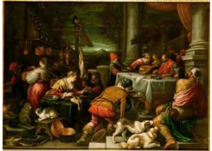
Lazarus and the Rich Man by Leandro Bassano (c. 1590-95)