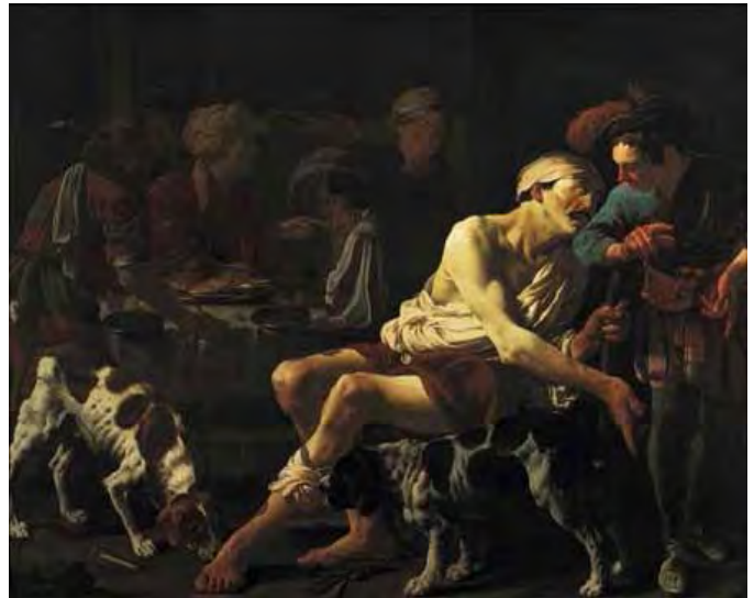
The rich man and poor Lazarus by Hendrick ter Brugghen, 1625