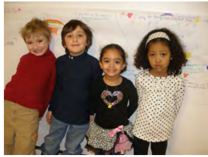
The kids above are in front of the prayer wall that they created.

“We will make children central to our life as a community.”