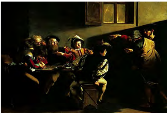
Caravaggio, The Calling of St. Matthew , 1599-1600