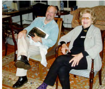
"My knees or your knees" (inside joke)