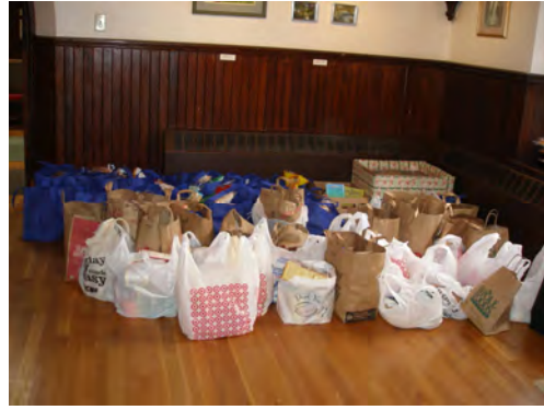
On Monday, the turkeys were added to these food bags.