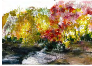
Watercolors and Mixed Media Ella McNamara through December 5, 2010